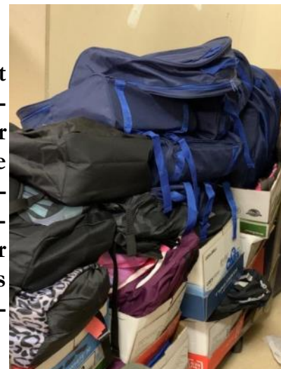
Filled backpacks ready for Food Center clients.